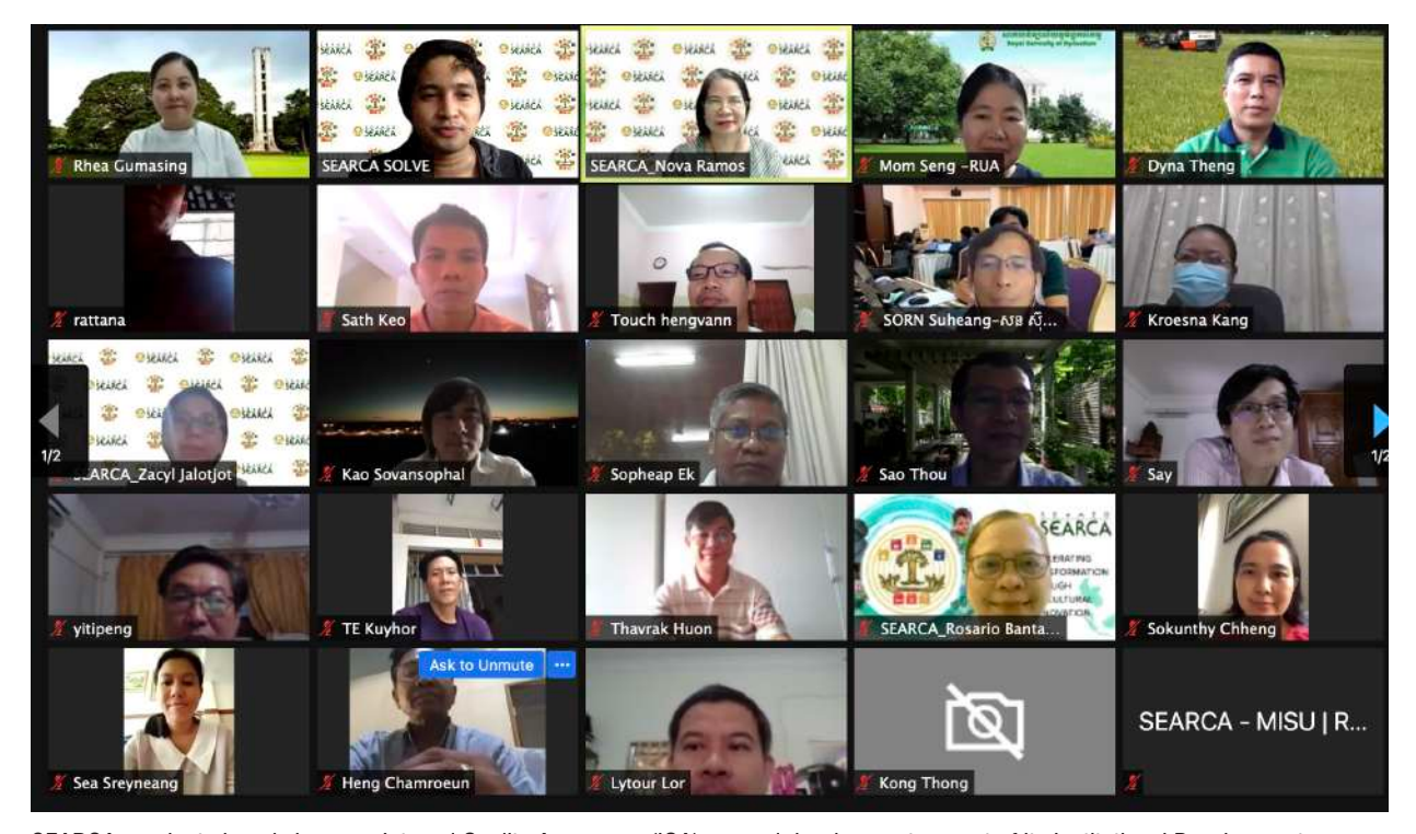
SEARCA conducted workshops on Internal Quality Assurance (IQA) manual development as part of its Institutional Development Assistance to RUA.

assets and talents. SEARCA conducted six online learning events under the HEIP project. These included Workshops on Internal Quality Assurance (IQA) Manual Development for RUA, Self-Assessment Report (SAR) and IQA Policy, IQA Manual Development, and the Presentation of SARs.