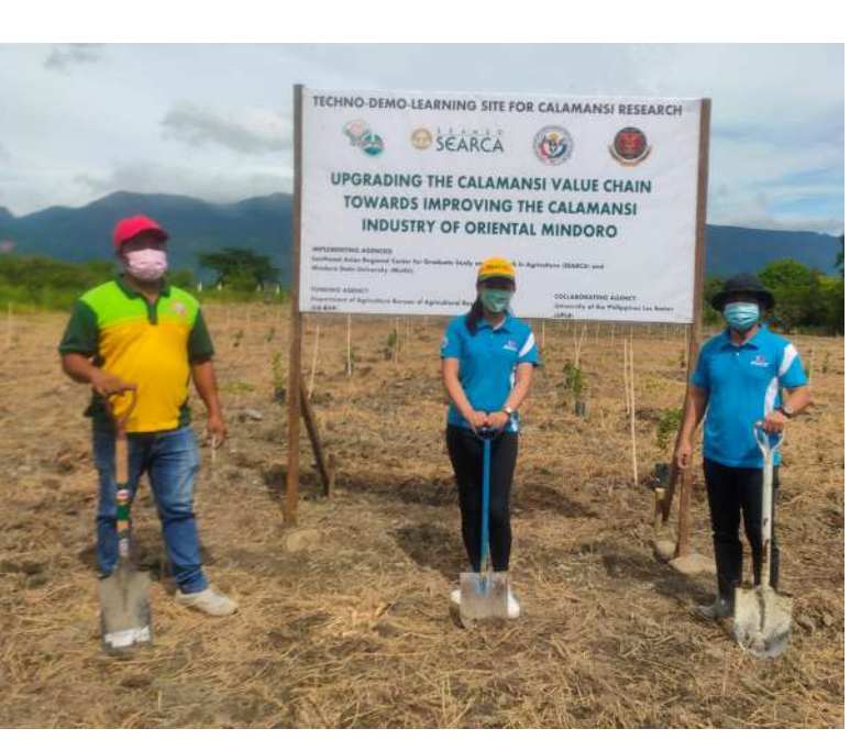
A ceremonial turnover of the techno-demo-learning farm for calamansi research in the Mindoro State University (MinSU) was held on 21 June 2021.

An initiative that also resulted from the project on effective models of ARD was Upgrading the Calamansi Value Chain towards Improving the Calamansi Industry in Oriental Mindoro (funded by the Philippines Department of Agriculture-Bureau of Agricultural Research). Research on calamansi off season production, pest and disease management, market and value chain upgrading studies were undertaken. Seminars, training, and fora were likewise conducted on utilization of waste products from calamansi, business opportunities for calamansi-based products,