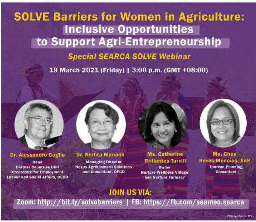
SEARCA tackled women in development in one of its SOLVE webinars.